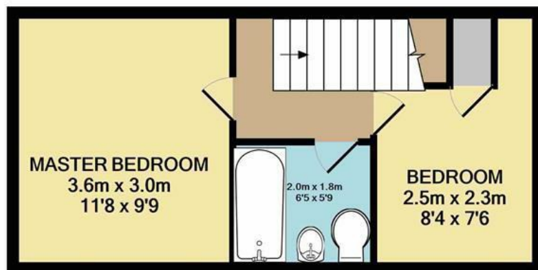
1ST FLOOR APPROX. FLOOR AREA 26.0 SQ.M. (280 SQ.FT.)

TOTAL APPROX. FLOOR AREA 55.0 SQ.M. (592 SQ.FT.)